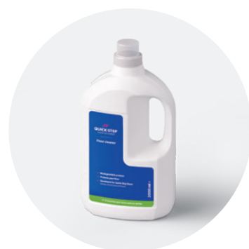
Floor cleaner 1 L or 2 L QSCLEANECO1000 QSCLEANECO2000