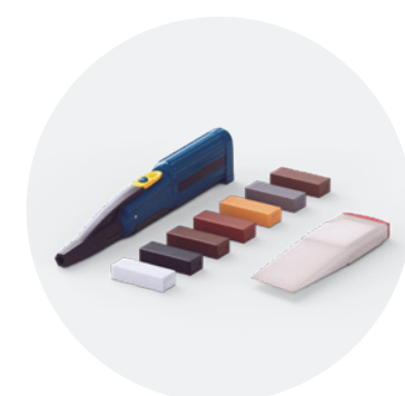
Repair kit QSREPAIR