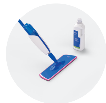
Cleaning kit QSSPRAYKIT