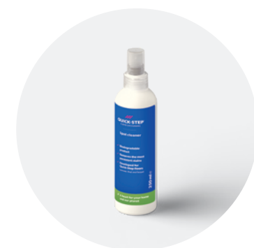
Spot cleaner 250 ML QSSPOTCLEAN